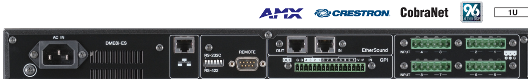
DME8i-C Rear Panel