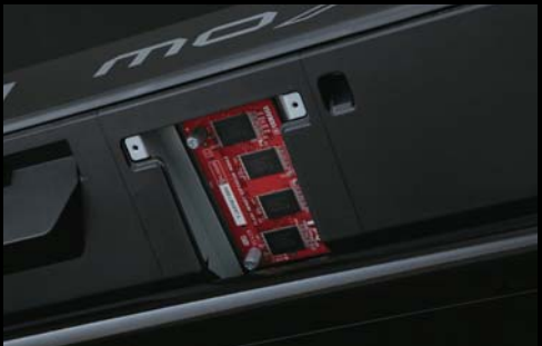
FL512M & FL1024M are sold separately.

The MOXF is fully compatible with the sound content developed for the MOTIF XF and MOX. The optional Flash board lets you add up to 1 GB of new samples to your MOXF to customize and tailor your sound set to your needs, using promotional contents like Yamaha's "Inspiration In A Flash" and "CP1 Piano," as well as the many third party libraries for sale.